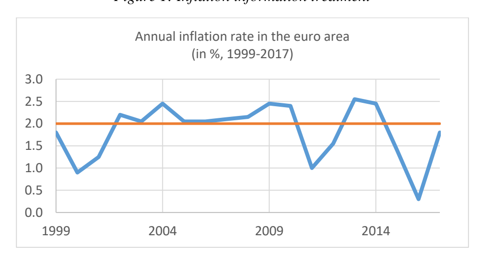
Figure 1: Inflation information treatment

Please take a look at the following graph showing the development of the inflation rate in the euro area. The ECB's objective is to keep the inflation rate below, but close to, 2% over the medium term. In the graph, this objective is shown by a red horizontal line.