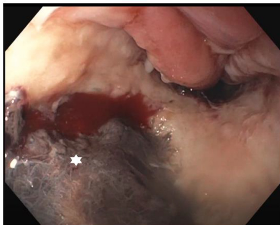
Fig. 1 – Endoscopy showed a pulsating and bleeding ulcerated esophageal cancer (asterisk).

The bleeding could not be stopped and computed tomography angiography (CTA) was performed to identify a suspected AEF. CTA demonstrated communication between the esophagus and the descending aorta as well as a pseudoaneurysm of the descending aorta (Fig. 2).