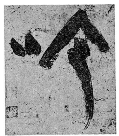
Gin' (Singing) by Jiun