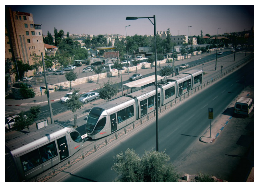
Figure 1: The Jerusalem Light Rail on its route along the Green Line, 2014.

In addition to projecting an image of harmonious shared space, Palestinian usage of the light rail was also aimed at protecting the infrastructure and the Jewish passengers on it, as the former CEO of the light rail operator noted (Interview with Former CEO, CityPass). Here we see how security thinking and normalization are intertwined: rather than exclude dangerous elements, as disciplinary power does, normalization in a security-based system integrates dangerous elements in order