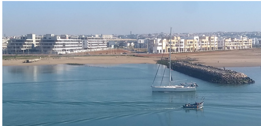
Figure 1: View on Bouregreg

1,700 new residential units, a new marina, luxury hotels, retail facilities, bars, and restaurants. La Marina Morocco, as its Abu Dhabi developer Eagle Hills calls it, has become a new luxury hub for living, leisure, and entertainment. But that's not all. A new bridge (Pont Moulay Hassan) now connects the two riverbanks. Together with two tramlines, a tunnel underneath the casbah, and a brand-new belt highway further along the valley, these state-of-the-art infrastructures improve mobility between two cities plagued by traffic congestion.