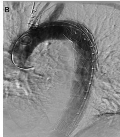
Fig. 3 – pTEVAR of AEF. (A) Aortic angiography shows an irregularity of the aortic wall (arrow). (B) The fistula was covered with an aortic stent graft using a pTEVAR approach.

Moreover, is goes along with less patient discomfort and lower procedural cost [9]. However, while it is increasingly used in endovascular aortic aneurysm repair there are no reports on a total percutaneous approach for endovascular repair in AEF.