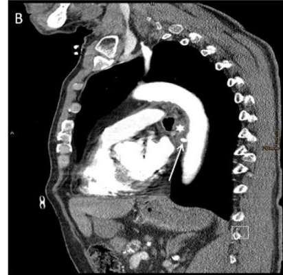
Fig. 2 – CTA demonstrates the connection between the descending aorta (arrow) and esophagus (asterisk) in form of a pseudoaneurysm in axial (A) and sagittal view (B).