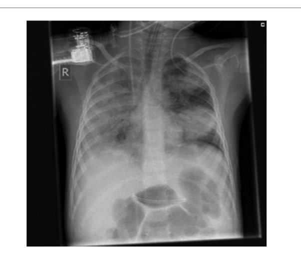
FIGURE 1 X ray case 1, twelve hours after admission.